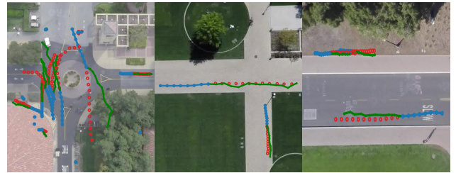
(b) Muticclass-SGCN (ours)